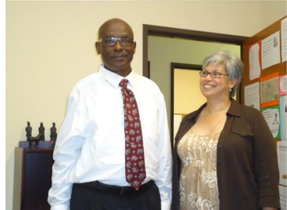
Getting ready for the first day of work in over 32 years